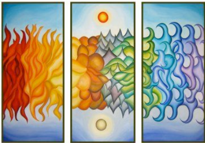
Fire, Earth, Air and Water (1997)