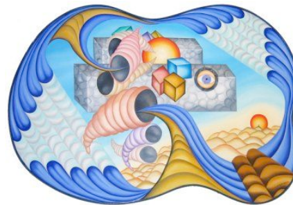
Piece of Mind (2000)