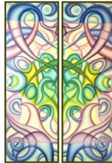
Piece of Mind (2000)