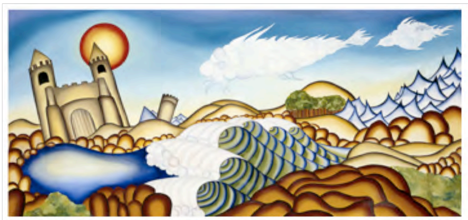
Where Dragons Fly